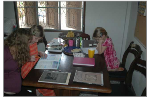
Working hard on homeschool

Six months in America had really dulled parts of my memory of our home here. The extremity of the heat, the bugs and the dirt have taken me a bit to get used to again. The morning we left Kentucky my girls went with their cousins to feed the horses. We had a beautiful snow the night before, and when they came back for breakfast they said, "The thermometer said its eight degrees outside!" Now when we landed in Thailand the temperatures were 98-100+ for the first 5 days at our friends' house! That is a 90+ degree temperature change! Once we arrived at our home in Dan Sai the temperatures settled down into the low-mid 90s. Being great with child, as I am, I felt like my skin was on fire and needed a lot of motivation to do simple things like unpack suitcases, cook for my family, or walk up and down the stairs. (No central air here, folks.) Brian, however, has been cutting things down and building and fixing things outside most days. I sing praises to God that our beautiful home in the mountains also comes with the added blessing of cool night breezes. We even had a fabulous thunderstorm yesterday which always cools things down a bit. As for the dirt that seems to accumulate and the ants who love to crawl on my toilet all day... que sera sera .