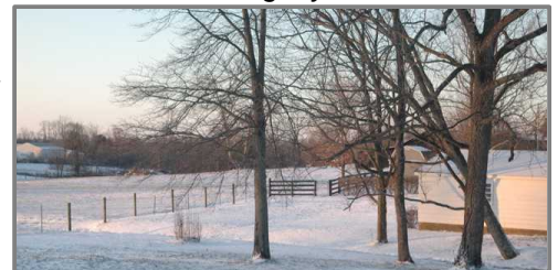
Snow on the ground the day we left Kentucky and it was in the high 90's in Thailand.