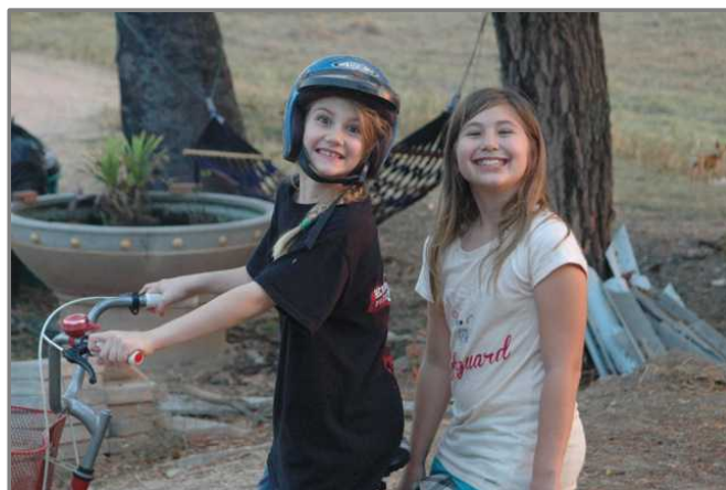
It was sooooo good to see the Hoar family again.