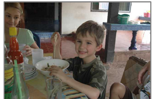
We missed our guay tiaw noodles