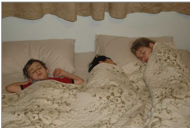
Jet lag naps