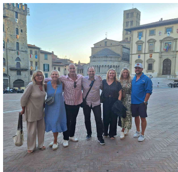
Fellowshipping with ministry partners in Arezzo