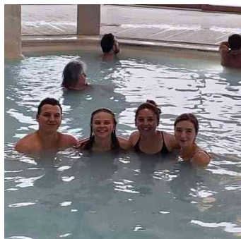
A thermal pool day with friends