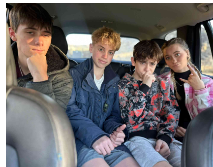
Heading to youth group in Florence