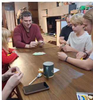
Game night with company last week - God sends really neat people to our home