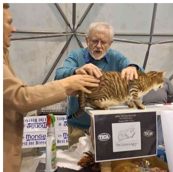
Judging our male Romeo at the TICA cat show of Reggio Emilia

Here is a photo dump of all the great people we fellowshiped with this year: