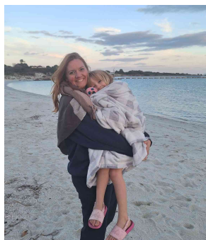
Taking advantage of a cat pick up to enjoy the beaches of Sardegna