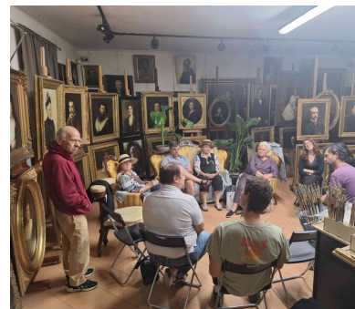
Bella Tuscany Tour clients visiting a Christian artist who is discipling young people through his art, in Florence