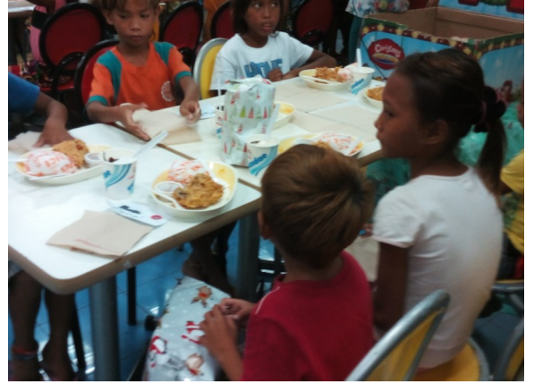
Above: Badjao Christmas party at Jollibee