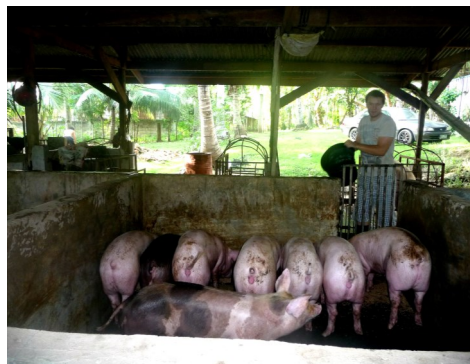
To the left: Our pigs are very healthy, in about one/two months we can sell them