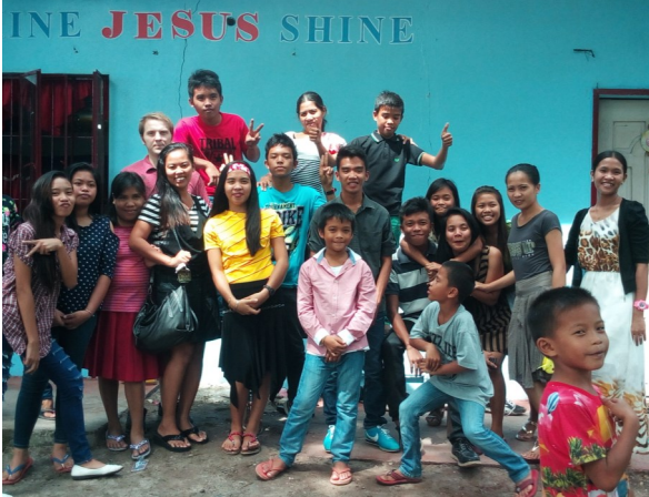
Above: Group pics at church

The future, the promises of God are before us, and we will be patient and steadfast to see these come to pass. In the meantime, we will be busy traveling the mountain-side serving God and sharing the kingdom of heaven to whomever will listen.