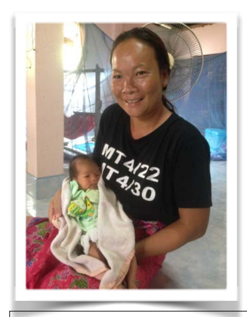
This woman could not have a baby until the believers prayers for her