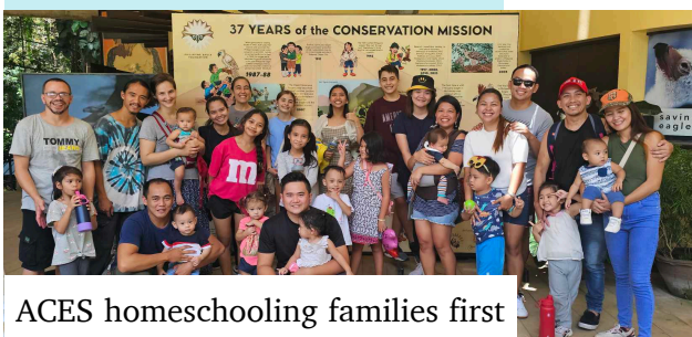
ACES homeschooling families first field trip to Philippine Eagle