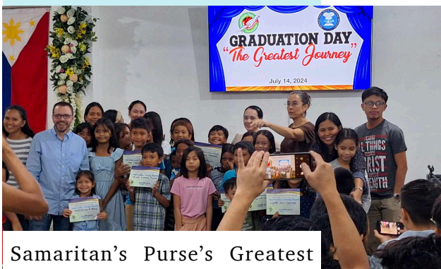
Samaritan's Purse's Greatest Journey graduation day