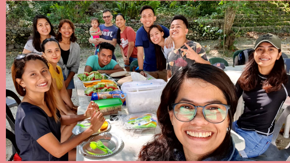
Kids Ministry Teachers team building at the beach.

The Lord impressed to us to be always available and be of help in anyway we can. With that, we have found ourselves involved with various ministries at Maranatha Family Church. We are connected with Partners, a group of young adults/professionals whose aim is to impact the community and be the labor force and financial help for the existing ministries and outreaches of the church. We are planning to have our first outreach for Christmas. We avail ourselves to assist with the Kids Ministry too.