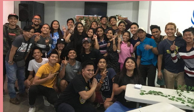
The Youth during the recent BURN-kada Acoustic Night held last November 11th.