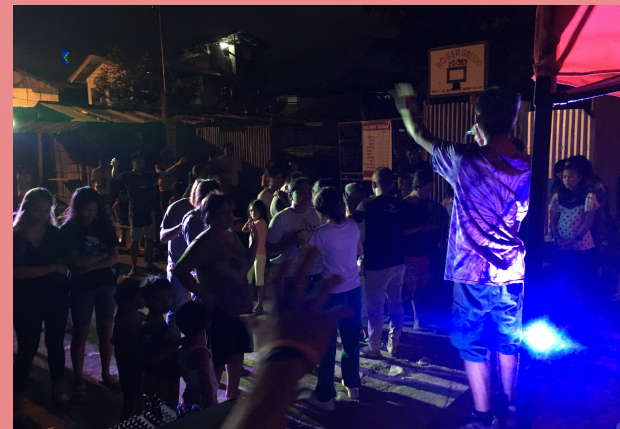
Adults responded to the altar call; kids praised and worshipped Jesus during the Crusade last October 12th.

It has been a year since we visited the US. However, we are still making payments for our plane tickets and other travel expenses which is around $3500. If you're led to give and help us pay them off, it would be a big blessing to us. Thank you so much. You can indicate Klein Travel in the memo line.