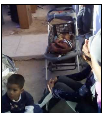
baby stroller (plastic crate tied in with plastic ties)