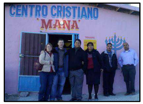
Preached and ministered for anniversary service