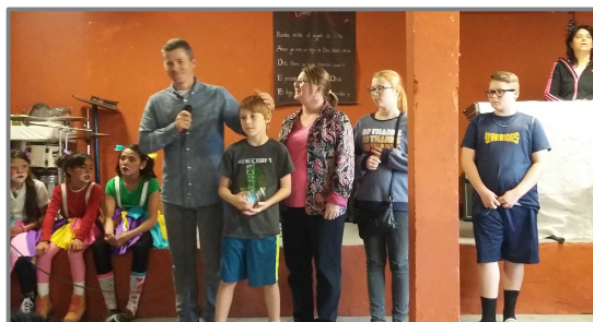
Greeting the children at the feeding outreach