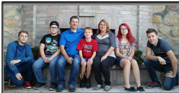
The Partridge Family