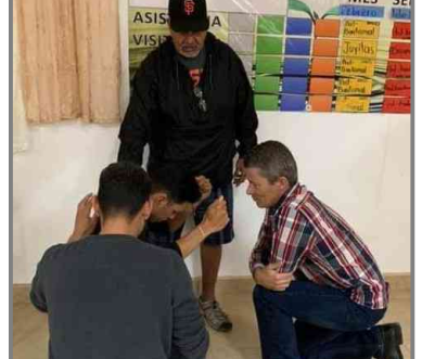
Praying with young man to fully commit his life to the Lord at Prayer Summit