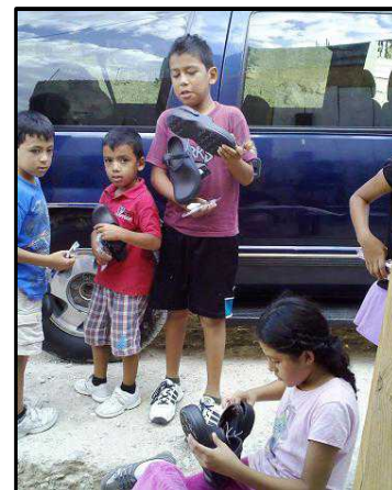
Our medical missions team gave out shoes