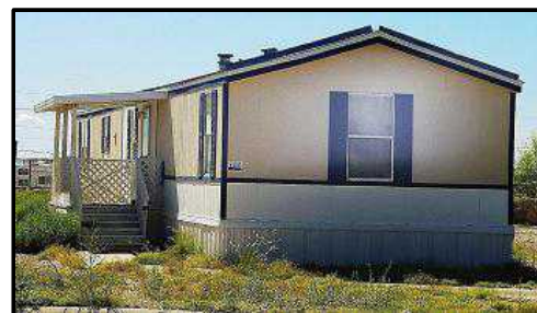
Our mobile home in El Paso, TX (God is so good!)