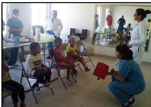
Consultation with children at our dental and medical outreach