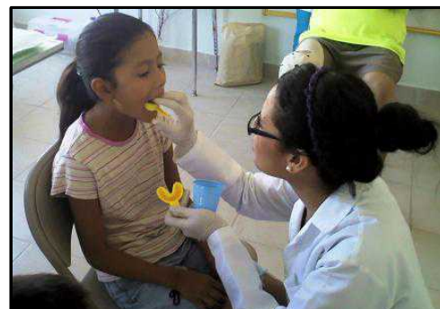
4 dental students in Juarez, Mexico donated time to help us with our dental outreach