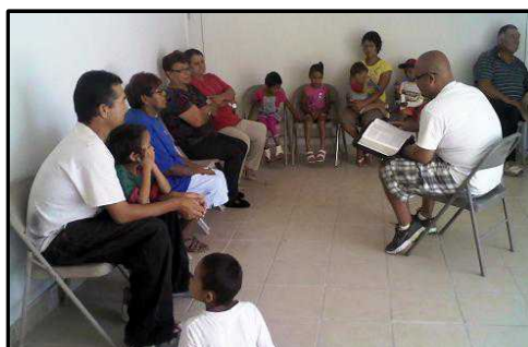
Our friend and translator sharing the Gospel to the people as they waited at our dental and medical outreach