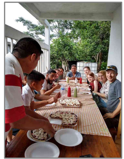
We were served a very special meal for our last breakfast in Jaltipan, Veracruz. It is called Memela. Que Rico! Very delicious!