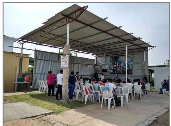
This church was started just less than a year ago. It is in the city of Coatzacoalcos, about an hour away from our host home in Jaltipan. Coatzacoalcos has a very nice beach. The Pastor took us to the beach after the service.

We then left Veracruz and traveled through the night and the next morning for about 14 hours to a small Mayan village in Quintana Roo called Altamirano. This village is basically in the jungle and has under 1,000 people. We were told that some of the people still only speak their indigenous language. The small church that was there had no walls. The Pastor with her daughters have only been working in this village for a little more than a year. She said that they usually have about 40 children and about 10-20 adults come on Sunday for service. So, we had no idea how many would come to the service. There ended up being about 350 people who came out from the village. The people were so open and many responded to receive Jesus! We then distributed clothes, shoes, toys, and school supplies. We ended the night by praying and ministering to the Pastor, her daughters, and those who help her in this village. God really touched them in a powerful way! We pray that God will allow us to return again to this village. It is amazing to see the love of God poured out on people no matter where they live in a city or a village in the jungle.