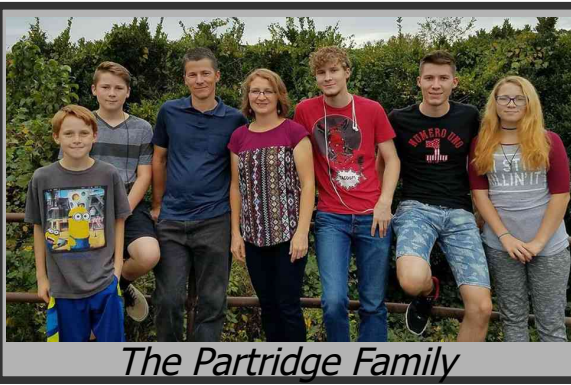
The Partridge Family