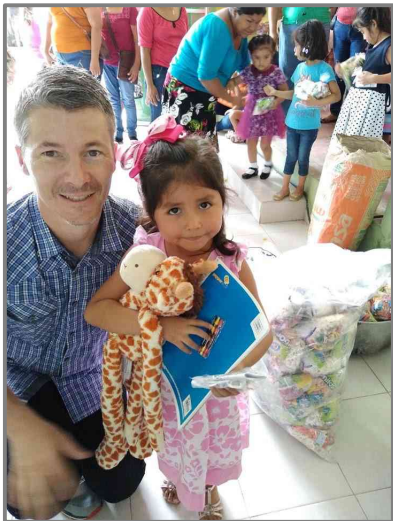
Church in Jaltipan. The children received school supplies, toys, and clothes.