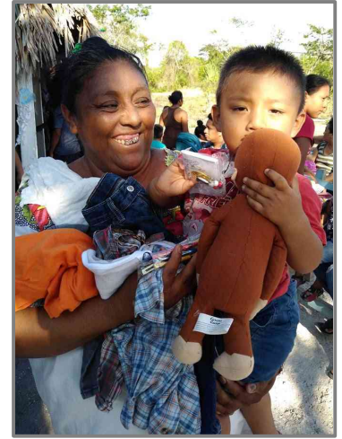
This mama and baby were very content and happy with the gifts they received. (Mayan Village)