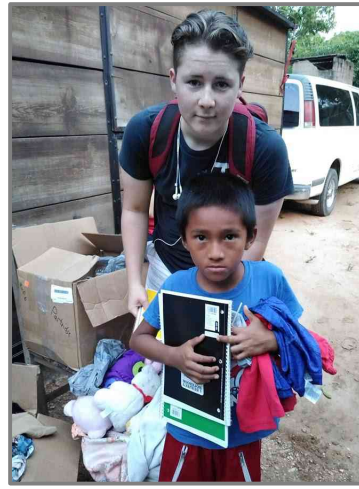
After the church service in Oteapan, we gave out clothes, school supplies, & toys to all the children.