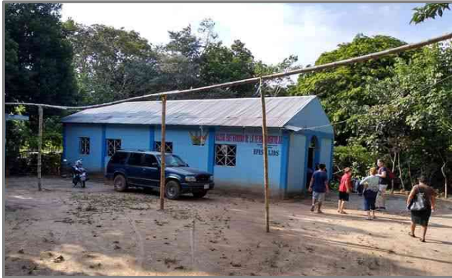
A church in Oteapan. After this service, we walked down the street and then through the woods to get to the Pastor's home where we were served dinner. It was night and the path through the woods to their home was dark.