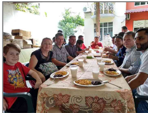
First morning at breakfast in Acayucan