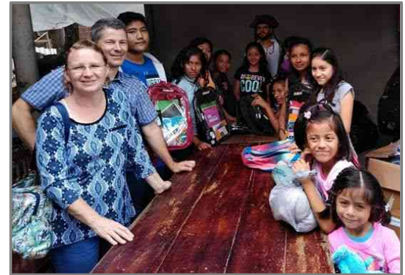
Our host Pastor brought these children from a nearby orphanage to his home and served them breakfast. Then we gave them backpacks with school supplies.