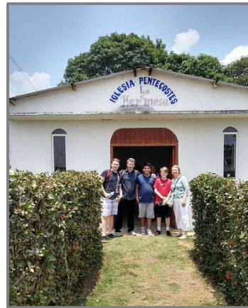
A church in Rancho Viejo. We drove through the woods down dirt roads to get to this church. The Pastor and his family were amazing! After the service, we went to their house where they served us a great meal.