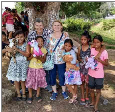
Colonia De Los Mangos, the children were so precious. They loved talking with us and they were happy with the gifts.