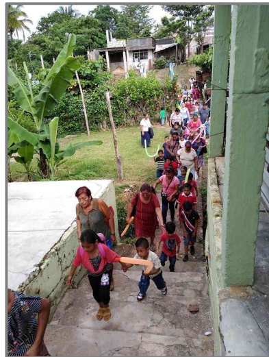
Church in Jaltipan. This church was right down the road from our host home. All these people coming to the service. The church was packed!