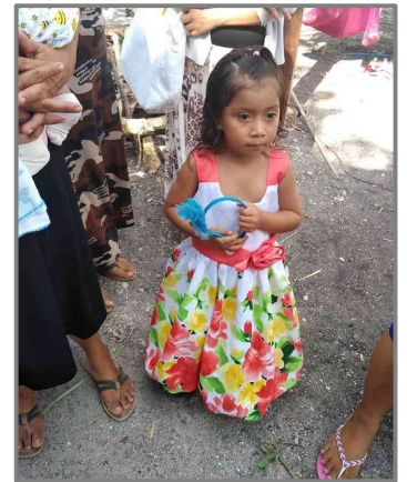
This girl loved the dress that she received from the clothes that we distributed in the Mayan Village.

Because the airport in Veracruz was a 15+ hour drive from the Altamirano village, we had decided to end our trip in Cancun which was about a 4 hour drive from this village. So, we had purchased 1-way tickets to Veracruz and 1-way tickets back from Cancun. This saved us money on our tickets, it was also less travel time, and we were able to enjoy the beach in Cancun. God is so good! If it wasn't for this ministry trip that brought us so close to Cancun, I don't think that we would ever be able to afford to go. We believe that God gave us this special gift and allowed us to enjoy a little time at the beach in Cancun. We had an amazing ministry trip! Many people were set free and delivered, many were powerfully impacted by God, and many received Jesus as their Lord and Savior. We were so blessed by all the love and hospitality. What a great way to end the summer! I wish that there was time to share with you all the stories and testimonies from this ministry trip, but just no time. One thing is for sure....God loves all the people of the world. No matter where they are or live, He will use you and me to reach out to them and share with them the love of His Son, Jesus Christ. What the world needs is Jesus!