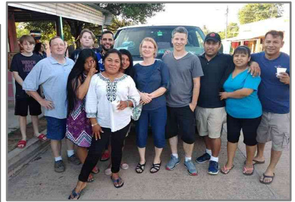
A picture of our team with the family who tirelessly served and hosted us in their daughter's home.