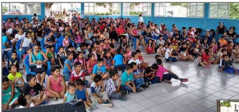
We had a church cancel on us at the last minute. So, this church in Colonia De Los Mangos invited us to come. They only had a few hours to prepare and invite people to come. No problem! The people came and packed the church.