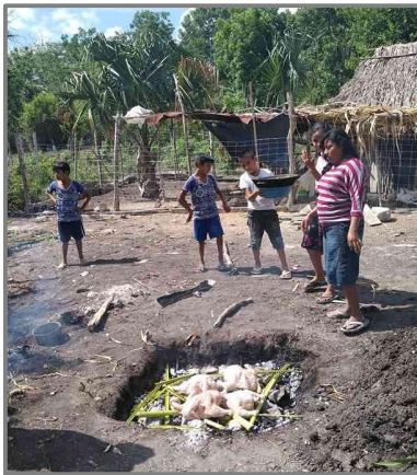
In the Mayan Village, they cooked fresh chicken for us. Dig hole, start fire, wait for coals, place chicken on branches, cover chicken with branches, cover it all with dirt, wait for a couple hours, remove and serve. Yummy!