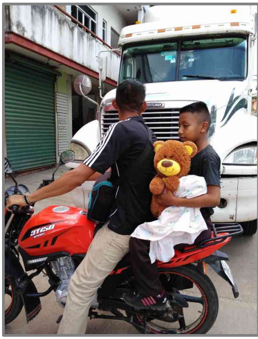
A boy and his dad who came to the service in Acayucan.