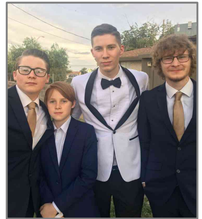
Our handsome sons on the wedding day

This summer was packed with a lot of ministry (Bible School & English Classes, Vacation Bible School Outreaches, Preaching in different churches nearly every Sunday, and much more). Ministry in Juarez this summer became a bit challenging because of the migrant crisis. So many migrants were coming into the US that there weren't enough border patrol officers along the border to handle them so they had to pull many officers from the port of entries to help with the crisis. Many times, when we arrived at the border crossing to come back to El Paso there would only be about 2 lanes open. Our wait time at the border increased significantly! We were waiting 2-4 hours to cross back to El Paso. It was terrible! We never knew how long it was going to take us to cross. This was causing us to get home very late after ministry. There were a few times that they closed the border down completely. El Paso was greatly affected by the migrant crisis. Thankfully, the situation is better and we are getting back to normal wait times.