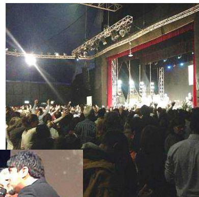
Benny Hinn Crusade