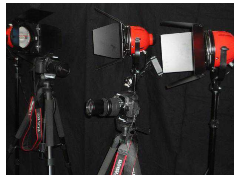
The new cameras!

We are still moving forward regarding "Revival and Supernatural" the Christian TV program that will be broadcast soon. In fact, we have made another purchase that completes what we need for the recording. We only need a bigger facility. We ask you to pray because we have received an offer to use a building. This building is 5 times bigger than what we have now. It would be great for our growing ministry. Please pray about this subject. Obviously, this will require an increase in the monthly budget, but we are sure that as God lead us so far, He will not leave us without funds. He is our Lord, and we work for Him.