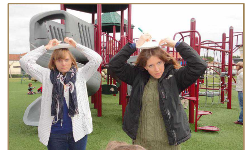
A very serious attempt at drawing a baby on a plate on my head