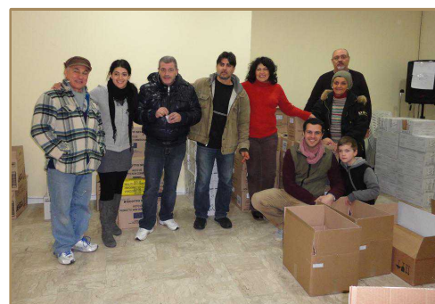
Some of the food bank volunteers.

We are continuing to do food bank once a month as an outreach to meet and develop relationships in which we can demonstrate the love of our Father. Each month when we distribute the food, many of the families pull one of us off to the side, share problems and ask for prayer. Many others come and tell us how God has answered the prayers we prayed with them, and they come with a list of more issues. We are seeing testimony after testimony of God's goodness in the lives of broken families and hurting hearts. Several of the people who were on the receiving end of the prayers, now show up early to help with the box prep and distribution. Now they help others as well and join us in prayer when new people come in.