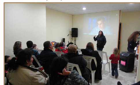
Getting ready for the first movie night!

This year, we began a monthly movie night for those from the food bank, and it has been a huge success. We offer free popcorn and drinks, and then have a time of discussion and prayer together after the show. The show list includes Facing the Giants , Courageous , Fireproof , Faith Like Potatoes , and The Jesus Film .