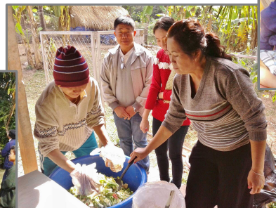
Neighbors helping make food for the party