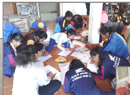
Teenagers in the living room.