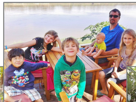
Morning coffee on the Mekong River