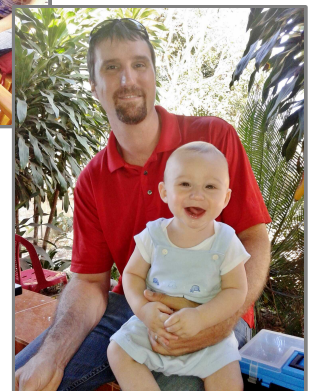
Daddy and his littlest boy