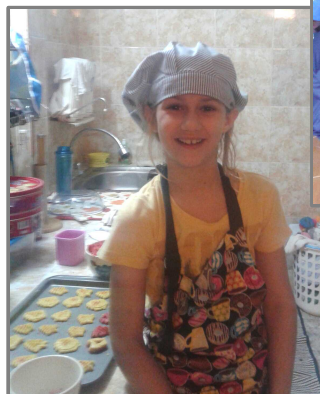
Making Christmas cookies