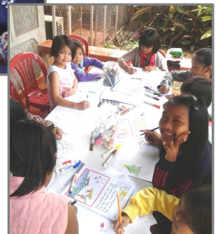
Neighborhood children drawing pictures