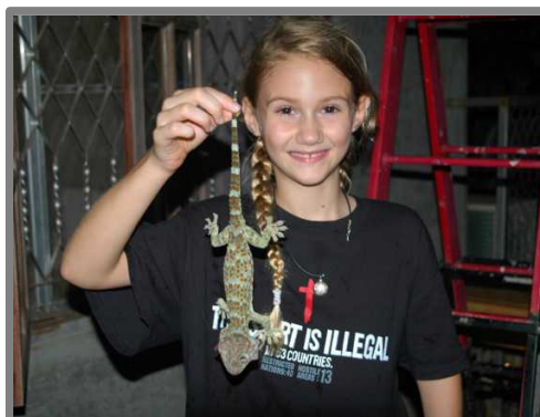
This was killed on our porch a few days before we left to come back to America.