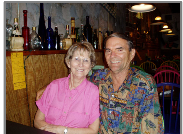
A great Father and Husband, he will be greatly missed.