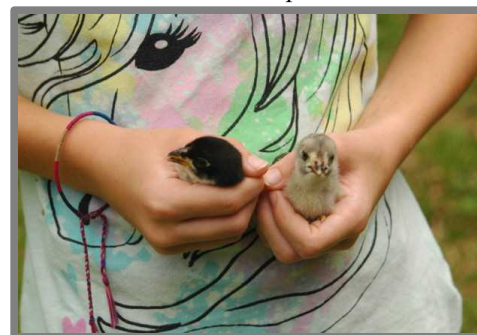
Mercy has adopted three little neighborhood chicks that have no mother.