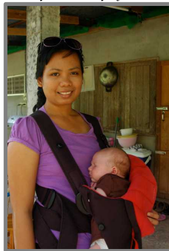
Nan enjoying our little treasure