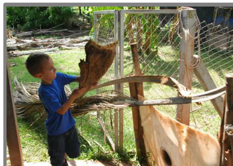
Helping daddy clean up the yard