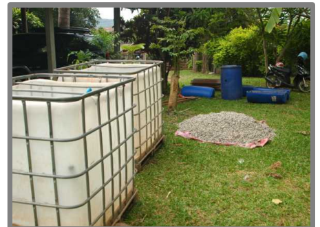
Aquaponics should be up and running again this week.